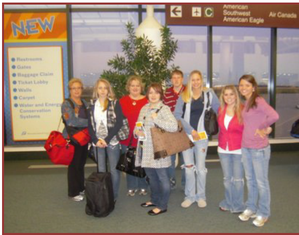
Red Boiling Springs FCCLA members travel to the Washington D.C. 2009 National Cluster Meeting

pledge, reinforcing the mission of FCCLA nationwide. Activities throughout the weekend included visiting many Washington monuments, the Smithsonian Institution and the White House. The meeting offered various presenters as well as a knowledge bowl.